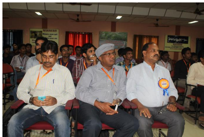
PHOTOGRAPH OF PARTICIPANTS ATTENDED IN WORKSHOP