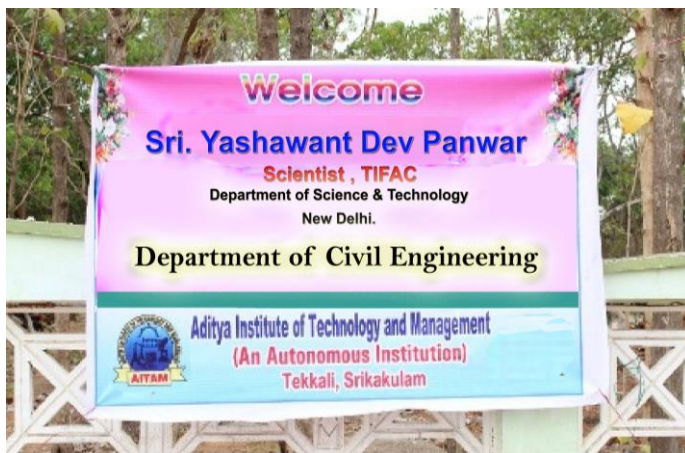
WELCOME BANNER TO RESOURCE PERSON