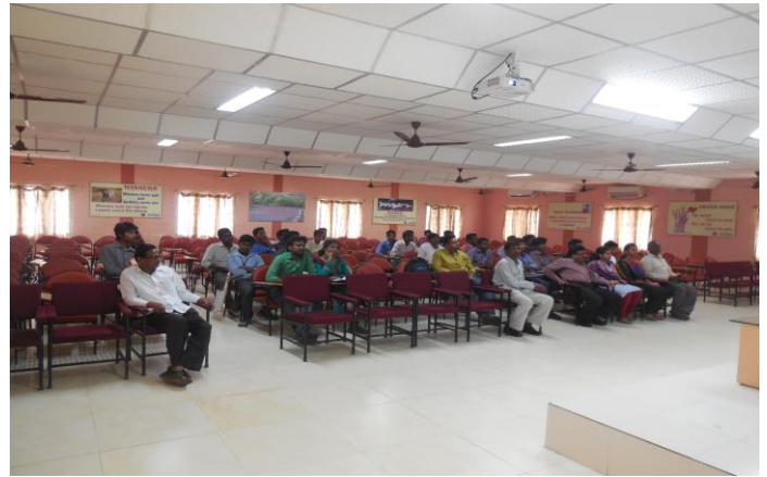
PHOTOGRAPHS OF PARTICIPANTS ATTENDED IN NATIONAL WORKSHOP ON INTELLECTUAL PROPERTY RIGHTS & INNOVATIONS