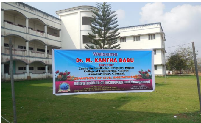
WELCOME BANNER TO RESOURCE PERSON