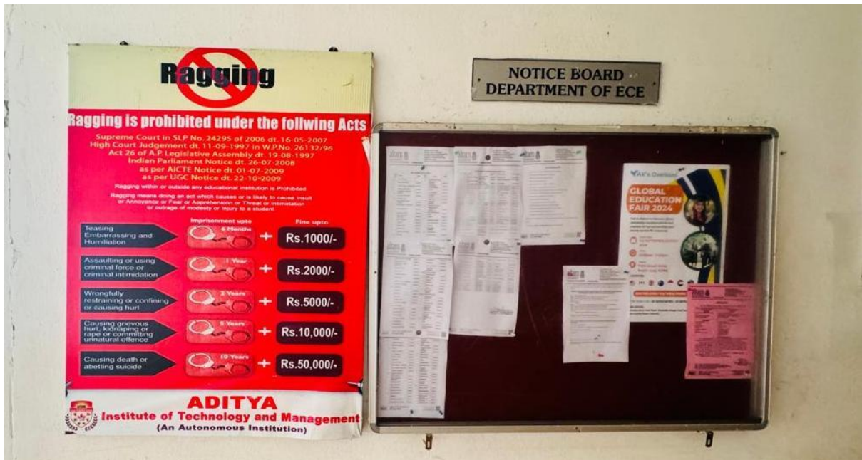
Posters around the campus and buses